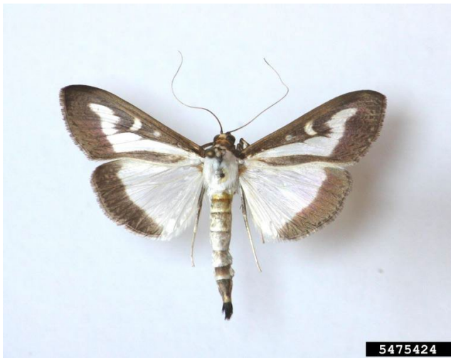
Figure 3: Box tree moth adults are fan shaped and have brown margins on their wings. The inner portions of the wing are white and make a triangle when at rest. Box tree moth adults tend to also have a white comma-like shape on the wing.

The adult moth is broadly fan shaped. On most adults, the exterior margins of their wings are brown and there is an inner white triangle that spans the wings and body. Some adults may be completely brown. The box tree moth superficially resembles the melonworm moth in coloration and the patterns on their wings. The box tree moth has white comma like markings near the wing margins that the melonworm lacks.