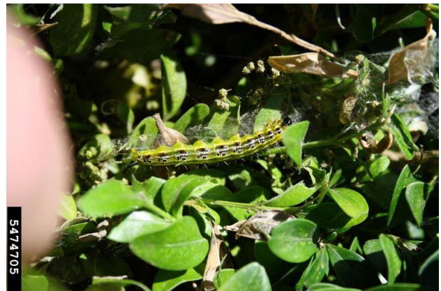
Figure 4: The mature larva of a box tree moth is about ½ inch long, with yellow-green coloration, black and white stripes down their sides, and a pair of black dots on each abdominal segment.

This pest overwinters as a caterpillar and resumes feeding in the early spring. They will stop feeding for 6-8 weeks and then resume feeding again in May. Following this, they will pupate, and the adults will emerge to reproduce. Their subsequent larvae would be the overwintering generation.