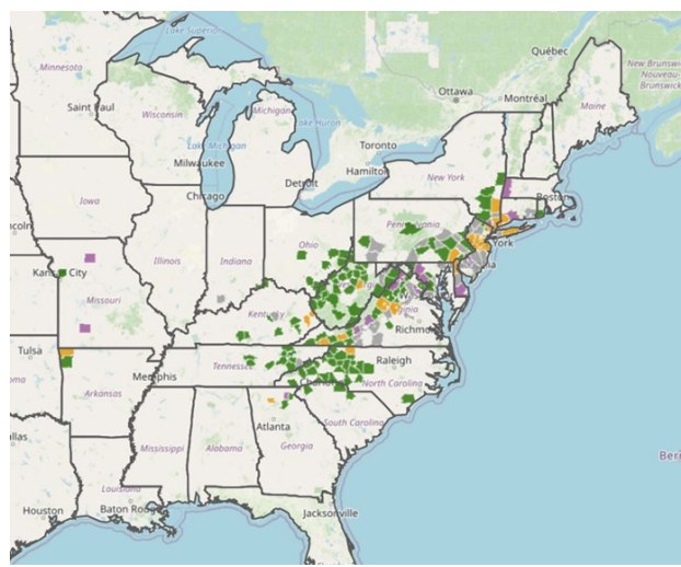
The known distribution of Asian longhomed tick in the US. This map is taken from the National Haemaphysalis longicornis (Asian longhorned tick) Situation Report as of mid-2023.

As of the revision of this fact sheet, there have been confirmed finds of ALT in: Arkansas, Connecticut, Delaware, Indiana, Georgia, Kentucky, Massachusetts, Maryland, New Jersey, New York, North Carolina, Ohio, Pennsylvania, Rhode Island, South Carolina, Tennessee, Virginia, and West Virginia.