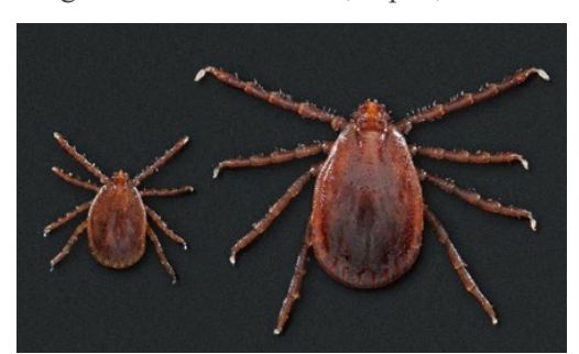
Asian longhorned tick (ALT) is an invasive species that is brown in color with little to no distinguishing markings. They are smaller than many of our native ticks. Photo by Centers for Disease Control.

The Asian longhorned tick (ALT) is an invasive species that was first confirmed in the US in New Jersey, in 2013 with subsequent confirmations in 2017. Since these initial finds, ALT has spread to multiple other states. It is native to East Asia, including the nations of China, Japan, and Korea.