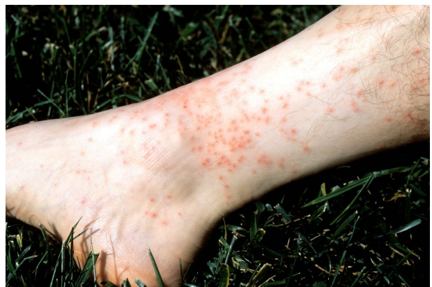
Figure 3: The ankles, knees, groins, waists, and armpits are all chigger bit hotspots. People can be bitten by a few to many chiggers and react in different ways. Some develop dots like we see here, others may end up with pustule-like bites.

If you do get chigger bites, they can be treated with over-the-counter medication (such as hydrocortisone, calamine lotion, etc.) or you may want to consult with a medical professional about prescriptions to help with relief.