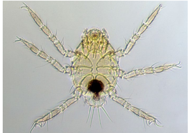
Figure 1: As immature mites, chiggers only have six legs. They are almost invisible to the naked eye; this image is highly magnified to show their body plan off.

Chiggers are parasites that feed on digested skin cells. They are the immature larval stage of a predatory mite. When chiggers are on their host, they will insert a tube-like mouthpart into the skin. Then, they will pump in their "saliva" which will dissolve the nearby skin cells. After this, they will slurp up the resulting skin slurry. This can happen over the course of 2-4 days. It is important to note that chiggers are external parasites. The mite doesn't burrow into the skin.