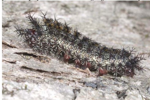
Figure 2. A mature buck moth caterpillar.

The mature two-inch caterpillar is brown to purplish black with numerous yellow spots. The body is clothed with branched black spines that may have red or black tips. These can be quite common on oak or willow trees from spring to mid-summer. They are commonly encountered when mature larvae wander off the trees where they fed in search of places to pupate. There is a single generation a year.