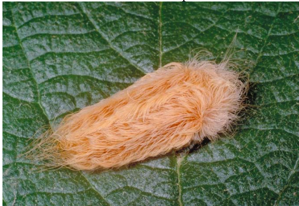
Figure 4. A puss moth caterpillar with hidden stinging hairs.

This one-inch caterpillar is covered with a dense woolly coat of soft brown hair, with hairs at the rear end tail-like. Beneath the long hair are numerous short poisonous spines that can cause severe irritation. They are found feeding on various trees and shrubs, including apple, elm, maple, hackberry, oak, sycamore and others. Young caterpillars often feed in groups. Sting severity increases with size of caterpillar. Puss caterpillar stings are often more severe than those of other caterpillars.