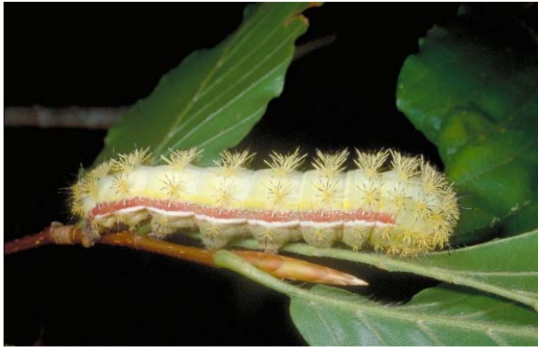
Figure 3. A mature Io moth caterpillar.