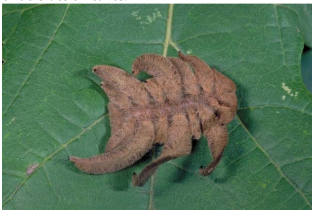
Figure 8. A hag moth caterpillar also known as the monkeyslug caterpillar.

A bizarre caterpillar that resembles a dried leaf. The caterpillar is brown with nine pairs of fleshy lobes, all with stinging hairs. It is found on lower branches of assorted trees and shrubs, including oak, chestnut, dogwood, sassafras and ash. The caterpillars are usually seen feeding on the undersides of leaves.