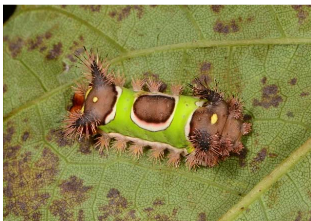
Figure 7. A saddleback caterpillar with one damaged horn.