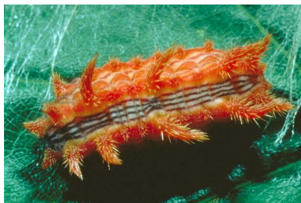
Figure 9. A stinging rose caterpillar.

A yellow to red spiny caterpillar with black and blue stripes down the middle of its back and less distinct red, blue and black stripes along the side of the body. There are prominent spiny yellow horns on the front, rear and center of the body. They can be found feeding on bushes and low tree branches of redbud, oak, hickory, bayberry, wild cherry and sycamore.