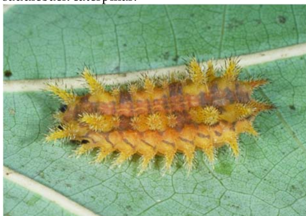
Figure 10. Spiny oakworm caterpillar.

The pale yellow green caterpillar has four dark patches of spines toward the rear and numerous spiny, yellow or red fleshy lobes. Grown caterpillars have a brown area on back. It feeds on oak, beech, chestnut, willow, pear, bayberry, sour wood, wild cherry and other trees. It is less venomous than the saddleback caterpillar.