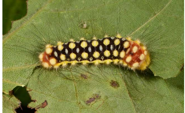
Figure 5. A white flannel moth caterpillar.

tuffs along this strip bearing hairs (setae). There are smaller tufts along each side of the body. The dark long silky hairs do not sting, but shorter needle like hairs at the base of the tufts are stinging. The larvae can be found on redbud, honey locust, hackberry, mimosa and beech. Larvae occur later in the summer.