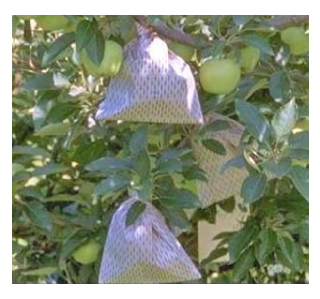
Figure 1. Bagging helps with pest management and improves fruit finish.

Homeowners plant apple trees for a variety of reasons: for the benefit of fresh fruit, for control over what pesticides are applied, or perhaps for nostalgic reasons. But producing quality apples in the backyard can be very challenging. Attempts at apple growing are frequently met with disappointment because trees and pests are poorly managed. Growers are frequently unaware of potential pest problems and management options.