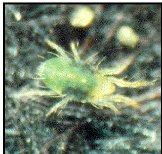
TWO-SPOTTED SPIDER MITE

operators recognize the two-spotted spider mite and understand how to manage it, the cyclamen mite remains a mystery to many. This factsheet describes the biology and management of cyclamen mites.