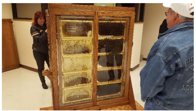
Figure 1. Observation hive can be very elaborate.

Honey bees are truly amazing creatures to watch, and an observation hive allows you to see day-to-day activities within the hive without disrupting or irritating the bees.