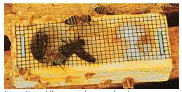
Figure 3Inspect the queen in her cage when she arrives.

Remove the pasteboard over the candy end of the queen cage and use a small nail to punch a small hole through the candy. Do not make the hole so large that the queen can get out immediately.