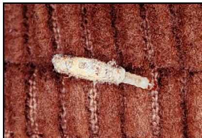
L. Townsend, Univ of Kentucky Entomology

Clothes moths are well-known as pests of stored woolens, but they will eat a wide range of other fibers including hair, fur, silk, felt and feathers. Serious infestations of clothes moths can develop undetected in a home, causing significant damage to clothing, bedding, floor coverings and other articles.