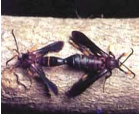
Banded Ash Clearwing Podosesia aureocincta