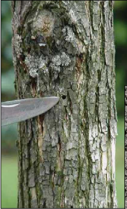
D-shaped exit holes, 1/8 inch