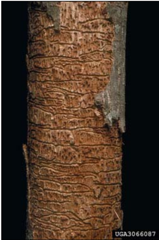
Eastern ash bark beetle Hylesinus aculeatus