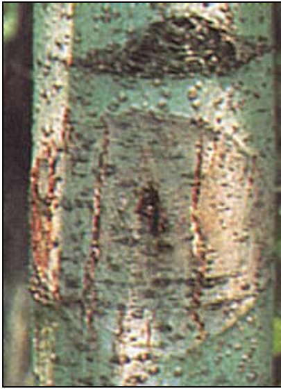
Stem canker caused by Cytospora pruinosa