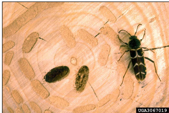
Banded ash borer Neoclytus caprea

Round exit holes. Larval galleries packed with frass.