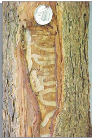
EAB gallery and exit hole (1/8 inch)