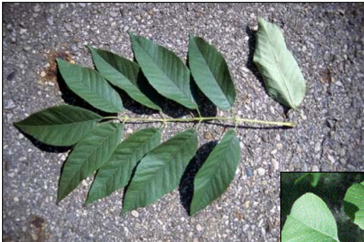
Compound and opposite