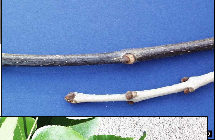
Green ash Fraxinus pennsylvanica Compound and opposite