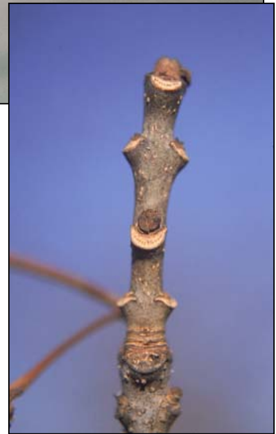
White ash Fraxinus americana