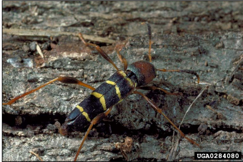
Redheaded Ash Borer, Neoclytus acuminatus