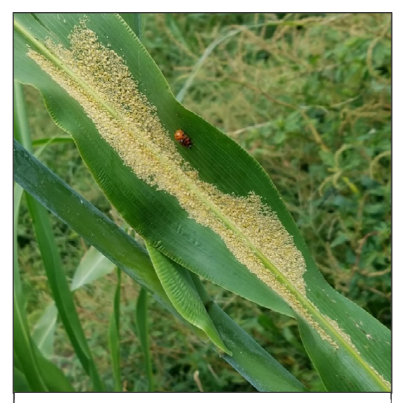
Figure 1. Over a thousand sugarcane aphids on a sweet sorghum leaf, counted by estimation.

yields from fields under heavy infestation. SCA infestations often start on the lower leaves of a plant, but as the season progresses will be found on higher leaves and the seed head. SCA is not known to transmit any plant pathogens that damage sweet sorghum.