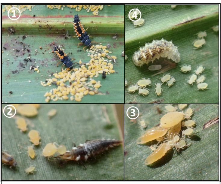
Figure 4. Sugarcane aphids being eaten by 1) lady beetle larvae, 2) lacewing larva, 3) aphid midge larvae, 4) hover fly larva

of the Section 18 label, be a certified pesticide applicator (private or commercial) and report acreage and volume sprayed to the Kentucky Department of Agriculture ((502) 573-0282 or agweb@ky.gov). This reporting aids Kentucky in obtaining the emergency exemption from the EPA in the future.