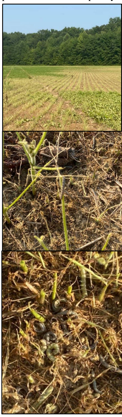
Figure 2. Soybean field damaged by fall armyworms in July 2021: (Top) defoliation of large areas of a double-crop soybean field, (Middle) a close-up of a soybean plant without any leaves, and a large FAW on the tip of a plant, and (Bottom) small pieces of stems remains along with high larva density on the ground

Fall armyworm is not a major soybean pest in KY however, occasional fall armyworm outbreaks can take soybean growers by surprise when their plants are defoliated quickly.