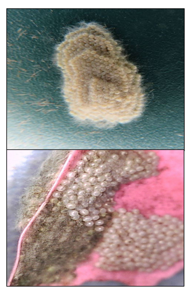
Figure 3. Egg clusters of fall armyworm: eggs are laid in layers and covered with scales

Migratory waves of fall armyworm usually can be present until the fall.