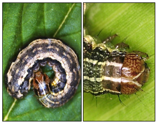
Figure 5. A distinctive, light-colored inverted Y mark is present on the head capsule of fall armyworms and coloration changes of FAW larvae

The thresholds used in North Carolina for defoliating insects in soybeans is 30% defoliation throughout the plant canopy 2 weeks prior to blooming (R1) and 15% defoliation throughout the plant canopy 2 weeks prior to flowering (stage varies) until the pods have filled (R7-R8).