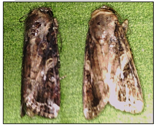
Figure 1. Female (F) and male (M) fall armyworms and two male FAW with folded wings.