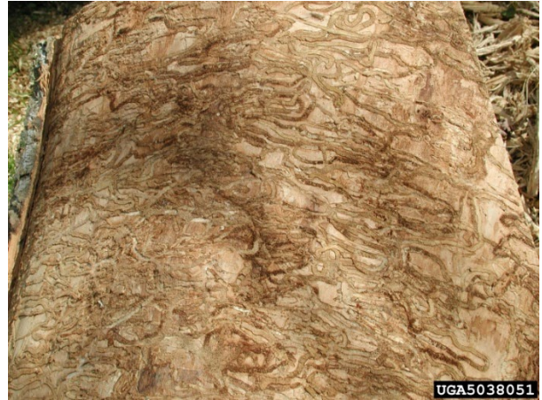
Figure 6: Emerald ash borer larvae do not bore their way into the heartwood of the tree but feed in the layers just below the bark. Their damage deprives the tree of nutrients and water, resulting in death.

tree while feeding, though they will penetrate farther into the tree to pupate. An individual tree can be home to many, many larvae over successive generations and as their feeding damage accumulates the tree will struggle to move nutrients and water throughout the plant and will die.