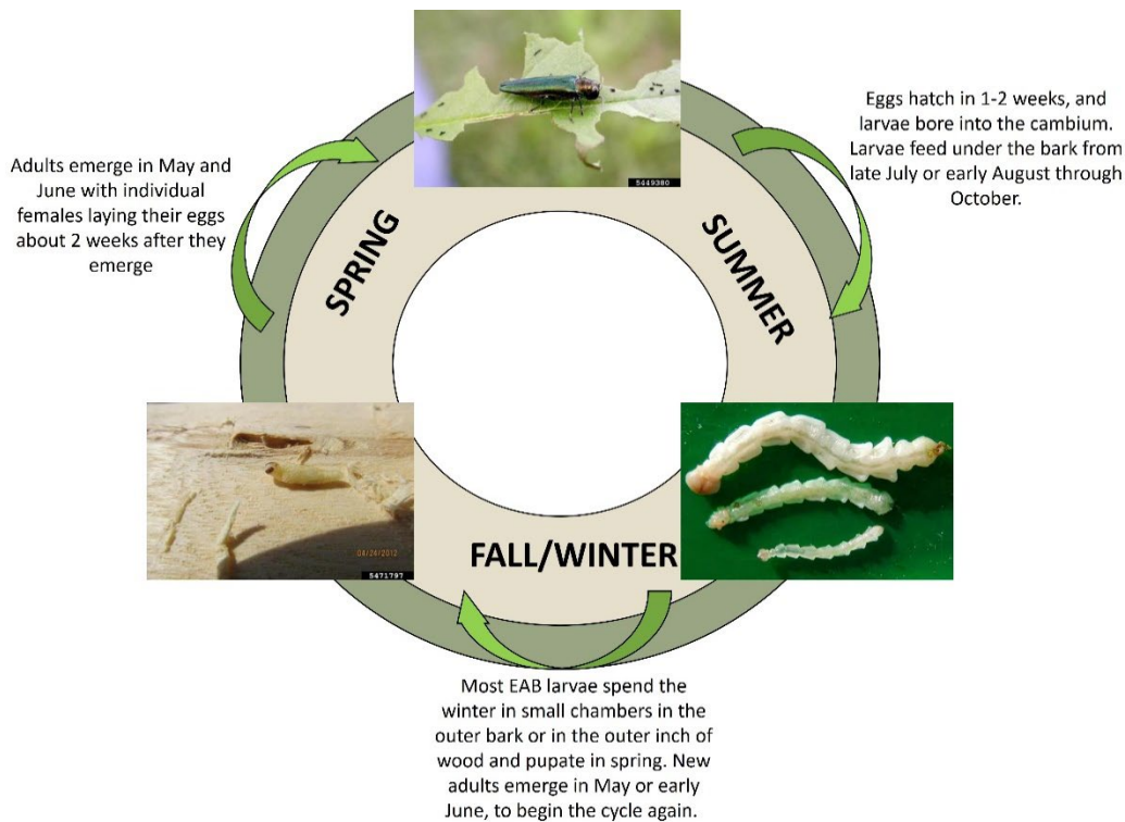
Figure 7: EAB in Kentucky generally will have a one-year life cycle, with larvae feeding through the summer before overwintering. They will pupate in the spring with adults appearing by early summer to lay eggs for the next generation.