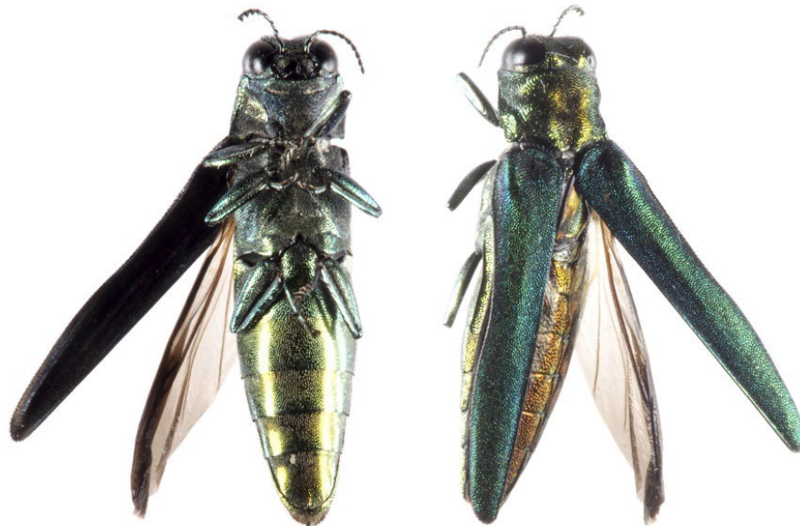
Figure 1: As adults, emerald ash borers are small (1/2 long and about 1/8 inch wide), metallic green beetles.