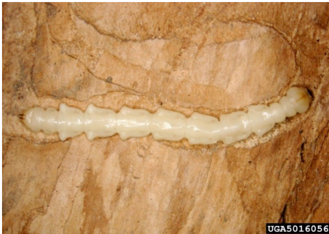
Figure 5: EAB larvae may not be visible, but they are damaging trees by extensively tunneling and cutting off the flow of water and nutrients.

Immature EAB, or larvae, tunnel just under the bark of trees and are the damaging stage. They have a flattened appearance and are creamy white with brown heads. The larvae are legless and composed of 10 bell-shaped segments along the length of their body. These larvae belong to a group of beetle larvae referred to as flatheaded borers, however there are many different species of flatheaded borers that impact different tree species (such as the flatheaded apple tree borer on apple trees).