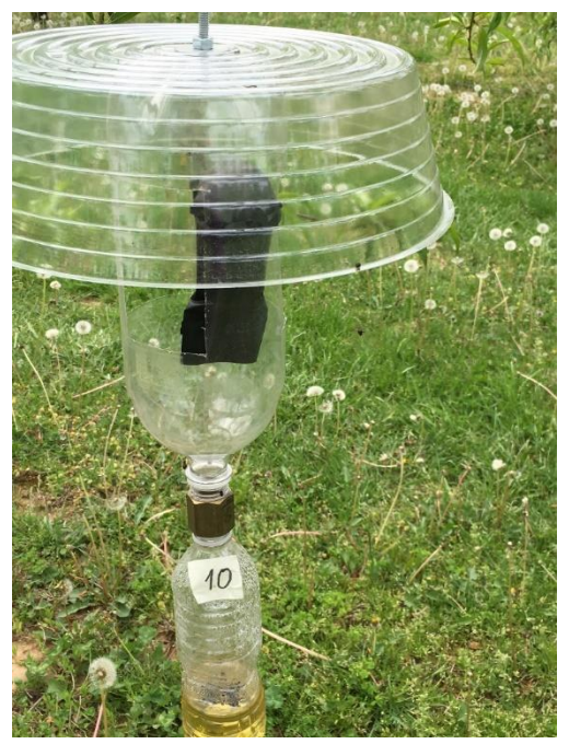
Figure 4. Modified Baker trap baited with ultra-high release ethanol. Camphor shot bores can be noticed hovering around and some more in the caching bottle.

were recorded in April in 2016 and 2017. Black stem borer is found in low numbers (Fig. 5). In 2018, the unusual cold spring moved the population peaks to early May and reduced the overall population level. Trapping must be complemented with tree inspection to spot the typical frass toothpicks (Figure 2). Infested trees must be removed from the nursery and burned. Keeping plants healthy through proper nutrient and water management practices is the primary strategy to avoid ambrosia beetle attacks. For container plant production, it is recommended to maintain 50% substrate moisture. If this is not possible due to spring rain, pyrethroid application every two weeks may be needed during periods of adult flight activity. Systemic insecticides are not effective because these insects do not feed on the plants, only the fungi. For more information, consult your county extension office.