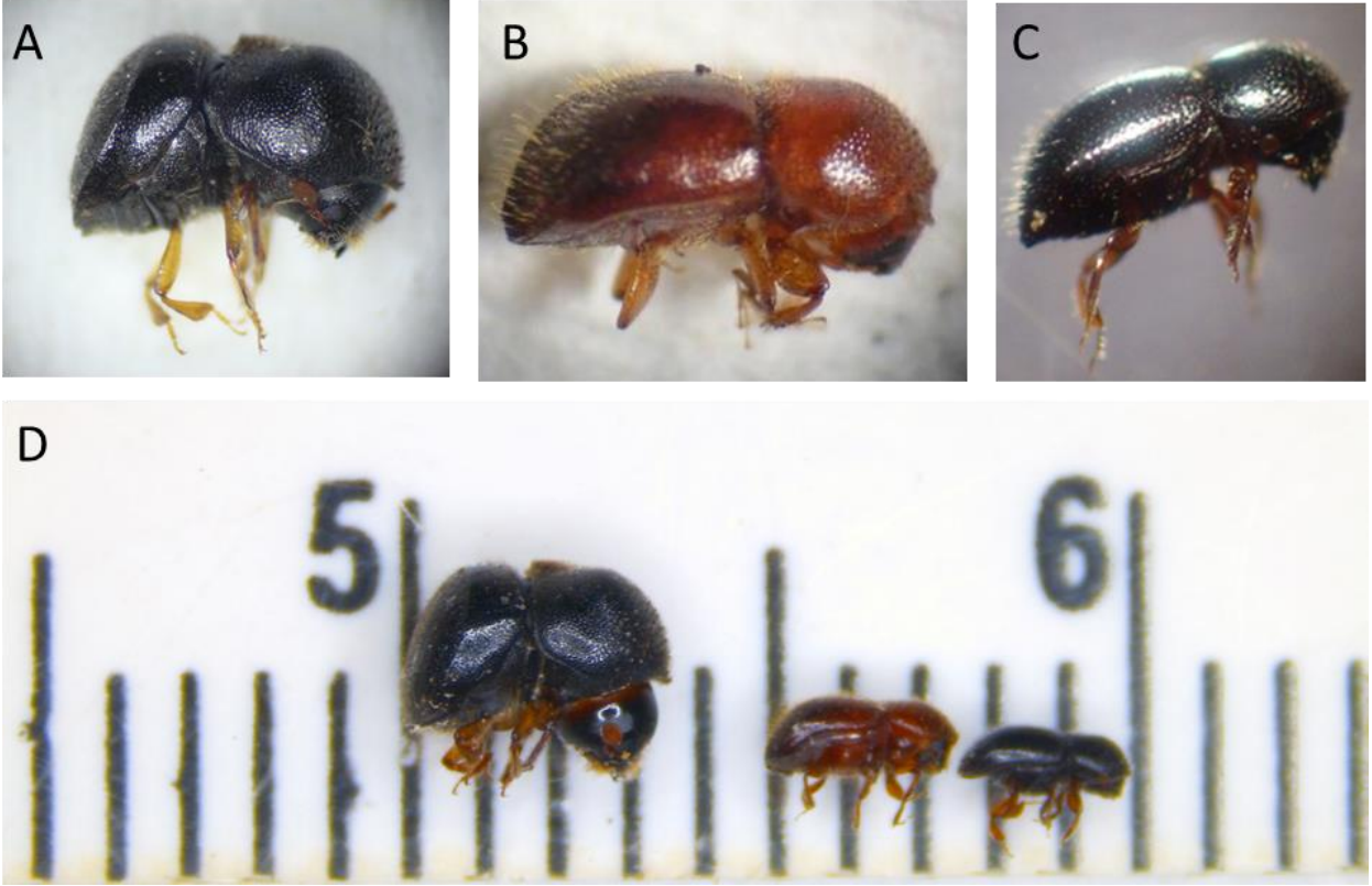
Figure 1. A) Camphor shot borer B) Granulate ambrosia beetle) and C) Black stem borer, D) Size comparison in millimeters.

colonize. Non-native ambrosia beetles are more aggressive and damaging than native species. Non-native species attack living and apparently healthy plants resulting in their death. Thus far, 45 exotic ambrosia beetle species have established in the USA. Five of them are considered serious pests. Granulate ambrosia beetle ( Xylosandrus crassiusculus ), camphor shot borer ( Cnestus mutilatus ) and black stem borer ( Xylosandrus germanus ) (Fig. 1) are non-native species commonly found attacking nursery crops, apple orchards and landscape plants in Kentucky.