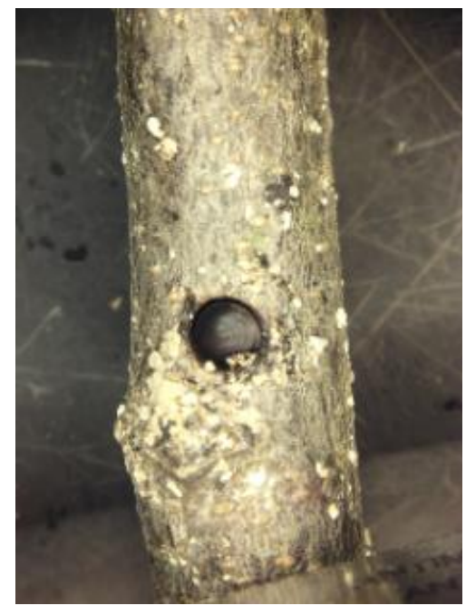
Figure 3. Camphor shot borer drills an Eastern redbud twig (~6mm).