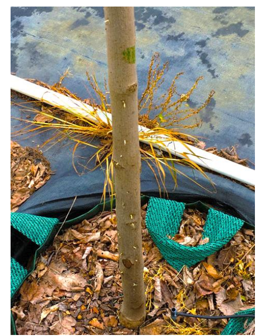
Figure 2. Maple tree recently attacked by granulate ambrosia beetle. Frass toothpicks can be noticed from close to the ground to more than 3 feet height.