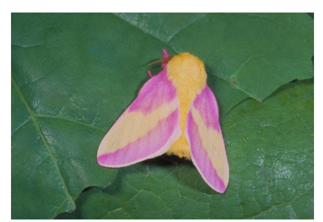
Figure 17. Rosy maple moth.

The male is slightly smaller than the female. The full-grown caterpillar is about 1.5 inches long, pale yellowish-green and striped with alternate pale yellow-green and darker green lines. The head is cherry red. On the second segment behind the head are two long, slender, slightly curved black horns. Short black spines occur along the sides of the body. On the lower side of the body near the rear is a rose-colored area. The preferred food is leaves of silver and red maples but they occasionally feed on box elder and oaks. Large colonies of caterpillars sometimes strip host trees in the mid-west.