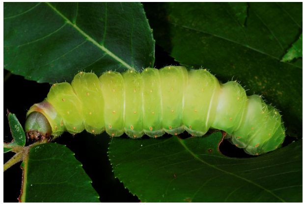
Figure 8. Luna moth caterpillar.

walnut and persimmon, but has also been collected from sassafras, willow, oak, beech, plum and iron wood. The cocoon is spun among the leaves of the host and falls to the ground when the tree's leaves are shed. The adult moths emerge in June to lay eggs.