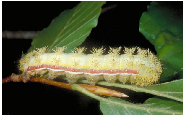
Figure 11. Io moth caterpillar.

The caterpillar is overall light green, but along each side there is a narrow lavender line bordered below with a white line. The caterpillars feed on a wide variety of plants including corn, roses, willow, linden, elm, oak, locust, apple, beech, ash, currant and clover.