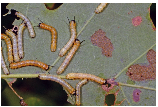
Figure 20. Spiny oakworm caterpillars.

Caterpillars of the spiny oakworm resemble those of the orange striped oak worm and the green striped mapleworm in many respects except the stripes are inconspicuous and the darker stripes are speckled with tiny white dots.