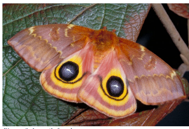
Figure 9. Io moth female.

This is not the smallest of the saturniid moths, but its wing spread of two to three inches is much less than that of average sized moths mentioned so far. The general color is yellowish with a large dark eye spot in the middle of each hind wing. The moths appearing in spring or early summer and can occasionally be found in fall.