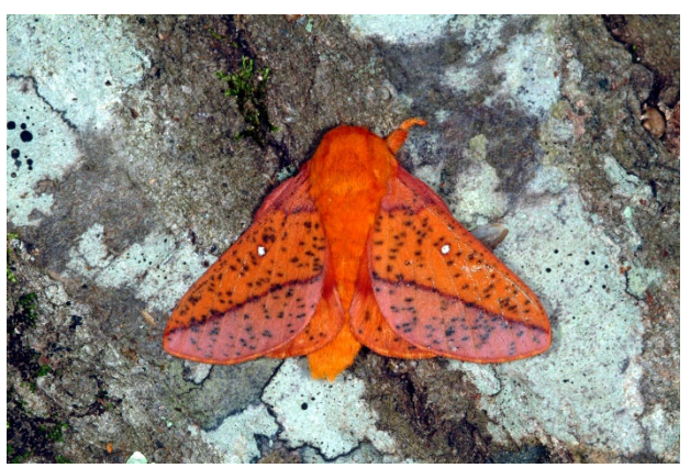
Figure 19. Spiny oakworm moth.

In the moth stage this resembles the orange-striped oakworm, but is more densely flecked with dark spots. The orange-striped species is more prevalent to our north. The spiny oak worm seems to be more common in Kentucky.