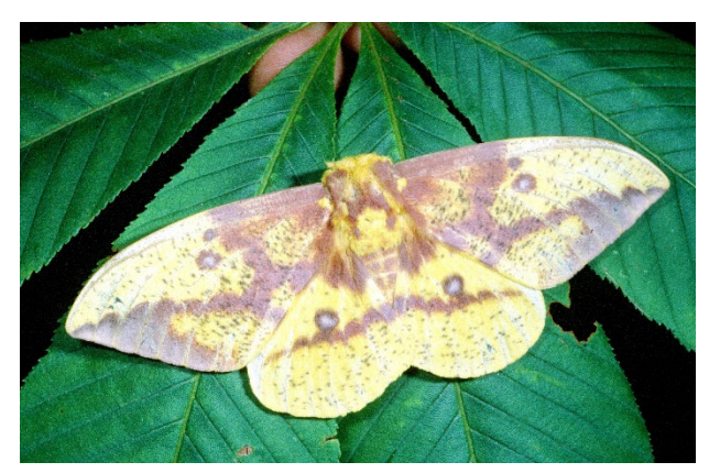
Figure 14. Imperial moth.

Fully developed caterpillars are three to four inches long and thinly clothed with long hairs. The barbed horns near the front of the body are much shorter than those of the hickory horned devil.