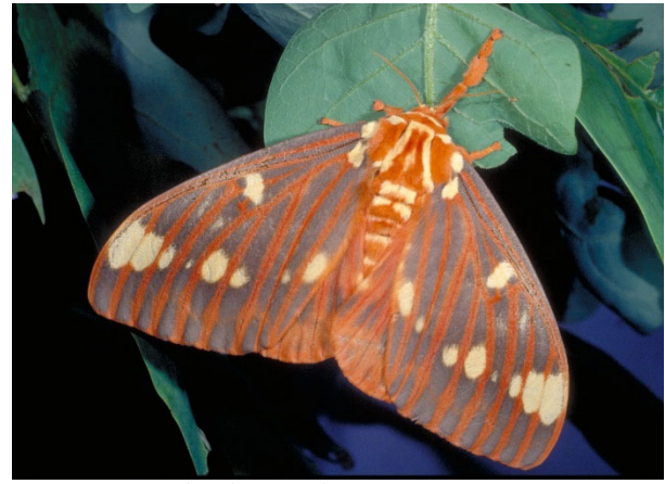
Figure 12. Royal walnut moth.

The caterpillar of this moth is known as the hickory horned devil. These two common names identify the caterpillars' favorite host plant, however they will also feed on sumac, sweet gum, lilac, persimmon, ash and beech.