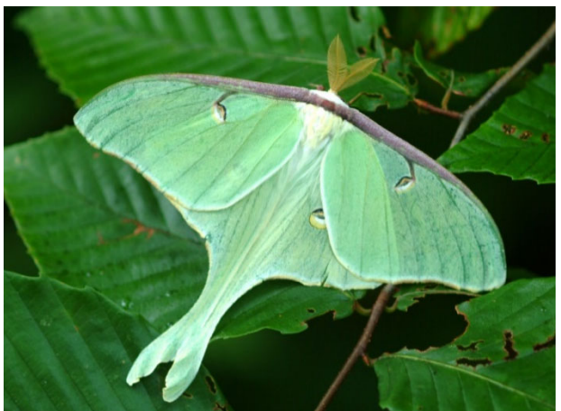
Figure 7. Luna moth.

This large pale green, swallow-tailed moth with a clear window eyespot in the front and hind wings makes this one of the most beautiful saturniid moths, much prized by amateur collectors. The wing span is about four inches.