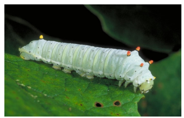
Figure 6. Promethea moth caterpillar

Tulip trees seem to be a favorite host plant but they will also feed on ash, azalea, bayberry, barberry, birch, button bush, cherry, lilac, plum, poplar, sassafras, spice bush and sweet gum.