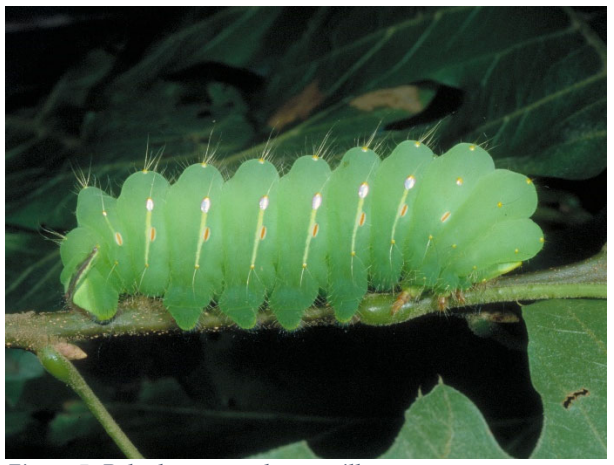
Figure 5. Polyphemus moth caterpillar.

The polyphemus caterpillar prefers oak, hickory, elm, maple and birch but apple, beech, ash, willow, linden, rose, grape and pine are also satisfactory host plants. The caterpillar's color is light green with narrow white bars on the sides.