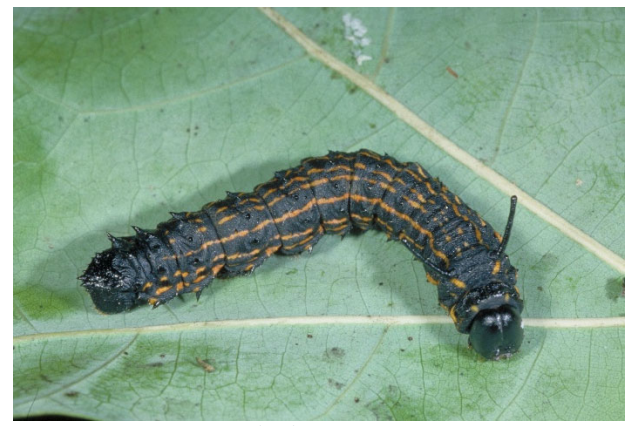
Figure 16. Orangestriped oakworm.

Beginning in June and extending over a period of about a month the moths emerge and lay eggs. Caterpillars of all sizes are found during the summer but they all mature by early fall. Several similar species also occur in Kentucky but they are more distinguishable in the larva stage.