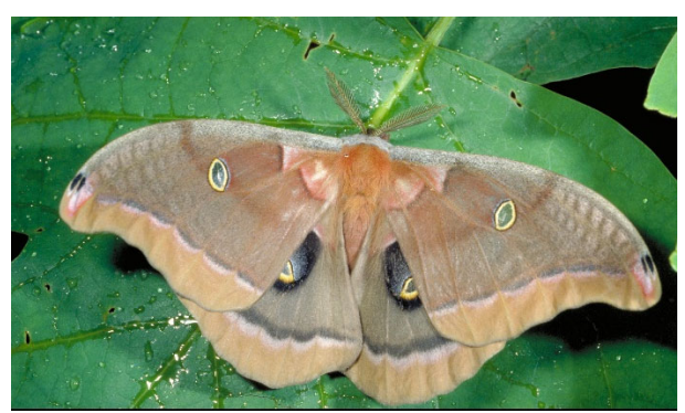
Figure 4. Polyphemus moth.

This light brown or fawn colored moth has a wing span of 3.5 to 5.5 inches. Except for the eye-spots, it is less distinctly patterned than either the cecropia or promethea. There is a relatively small window-like spot near the middle of each wing, but the window of the hindwing is surrounded by a dark patch which makes it appear larger.