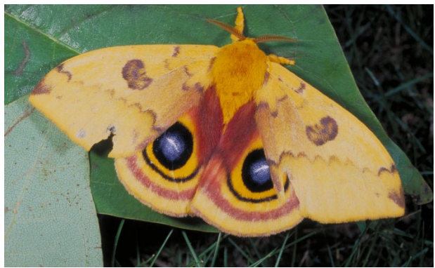
Figure 10. Io moth male.

The caterpillar is overall light green, but along each side there is a narrow lavender line bordered below with a white line. The caterpillars feed on a wide variety of plants including corn, roses, willow, linden, elm, oak, locust, apple, beech, ash, currant and clover.