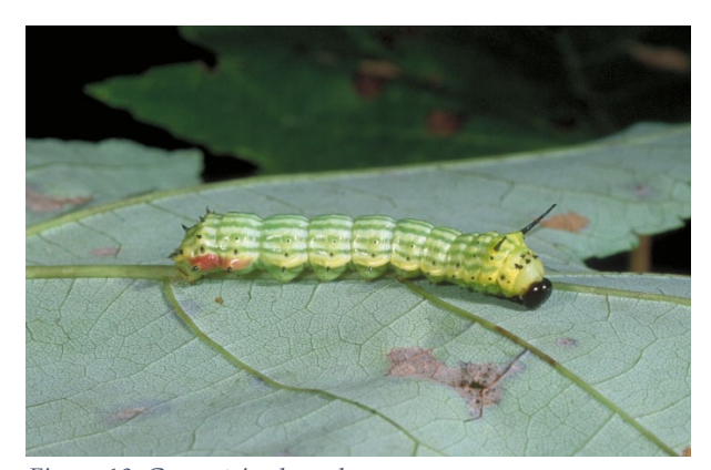
Figure 18. Greenstriped mapleworm.

The male is slightly smaller than the female. The full-grown caterpillar is about 1.5 inches long, pale yellowish-green and striped with alternate pale yellow-green and darker green lines. The head is cherry red. On the second segment behind the head are two long, slender, slightly curved black horns. Short black spines occur along the sides of the body. On the lower side of the body near the rear is a rose-colored area. The preferred food is leaves of silver and red maples but they occasionally feed on box elder and oaks. Large colonies of caterpillars sometimes strip host trees in the mid-west.