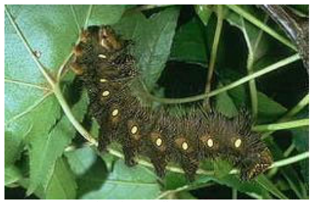
Figure 15. Imperial moth caterpillar.

Fully developed caterpillars are three to four inches long and thinly clothed with long hairs. The barbed horns near the front of the body are much shorter than those of the hickory horned devil.