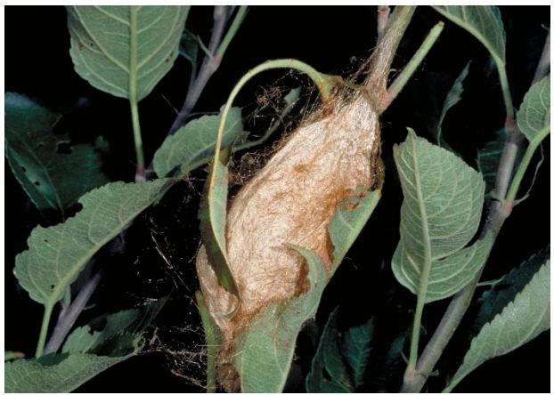
Figure 3. Cecropia moth cocoon.

In early fall the mature caterpillar spines a spindle-shaped cocoon which is about three inches long. The cocoon is attached along its full length to a twig on the host tree. Inside the cocoon the caterpillar changes to a pupa, the life stage in which it spends the winter.