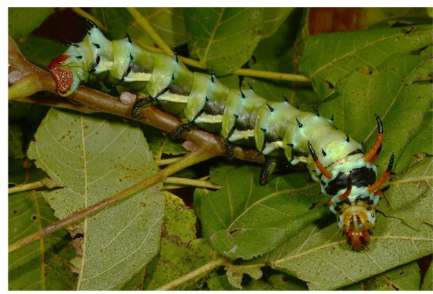
Figure 13. Hickory horned devil.

They are the largest of the silk moth caterpillars and commonly grow to five inches. The long barbed horns on the forward end of the body makes the caterpillar look intimidating but it is entirely harmless to humans.