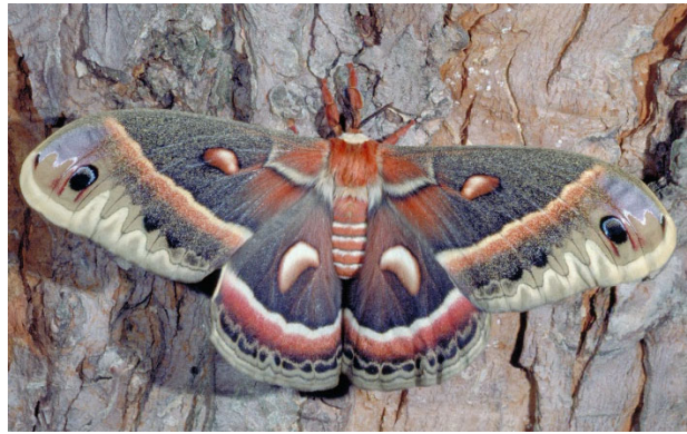
Figure 1. Cecropia moth.

eggs. They are often found at lighted windows at night.