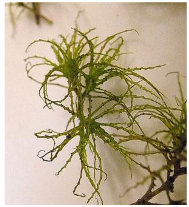
Brittle naiad

beneath the water's surface and can grow near the bottom in channels and other deep areas.