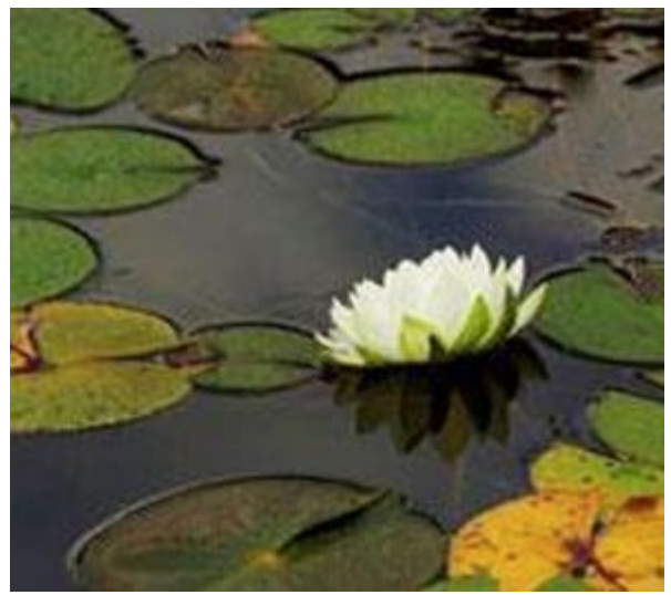
Water lily

<u>Water lily</u> differs from spatterdock in having round rather than heart-shaped leaves and often a white flower.