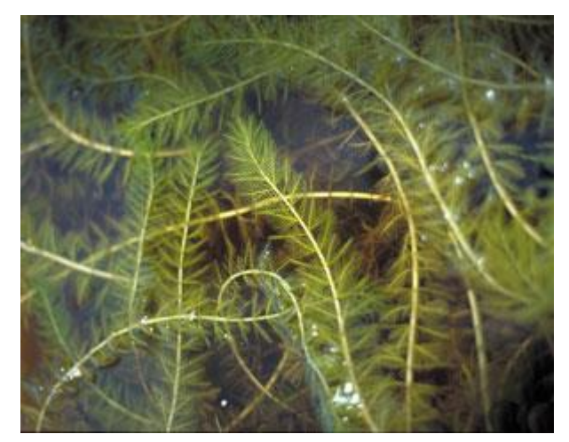
Eurasian watermilfoil

Brittle naiad is a submersed annual aquatic plant that spreads by seeds and plant fragments. Its oppositely arranged leaves are 1 to 2 inches long and are toothed, stiff, and pointed. Brittle naiad resembles coontail but its leaves are in pairs while coontail leaves are in whorls of 4 or 5. It can form dense mats that outcompete native species and can interfere with recreational activities.