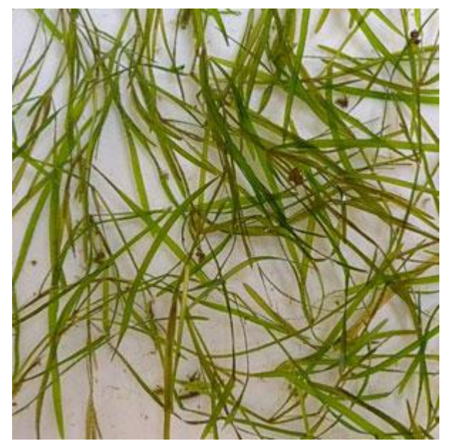
Leafy pondweed; John Hilty, Illinois Wildflowers

The leaves of <u>Curly-leaf pondweed</u> are somewhat stiff and crinkled, approximately 1/2-inch wide and 2- to 3-inches long. Small teeth are visible along the edges of the leaves, which are arranged alternately around the stem. Leaves become denser toward the end of branches. The plant appears reddish-brown in the water but is actually green when pulled out and examined closely. Curly-leaf pondweed grows best in the spring and tends to die in the summer. It is common in ponds, lakes, and ditches.