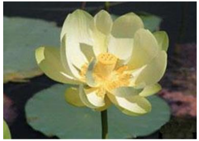
Water lotus

<u>Water lily</u> differs from spatterdock in having round rather than heart-shaped leaves and often a white flower.