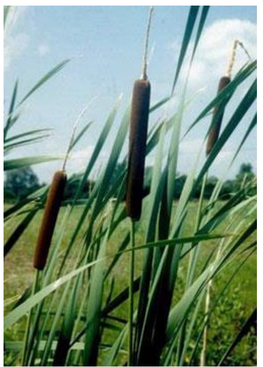
Cattails: Ohio State Weed Lab, The Ohio State University, Bugwood.org

Emergent (shore or marginal) plants commonly include cattails, bulrushes, spike rushes, reed canarygrass, and other grass-like perennial plants. Broadleaves include willow trees and creeping water primrose.