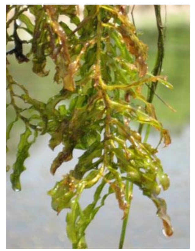
Curly-leaf pondweed

Submersed plants are rooted in the bottom sediments and may grow up through the water column . Flowers or flowering spikes sometimes emerge above the water surface. The main criteria for identification are leaf arrangement and leaf shape.