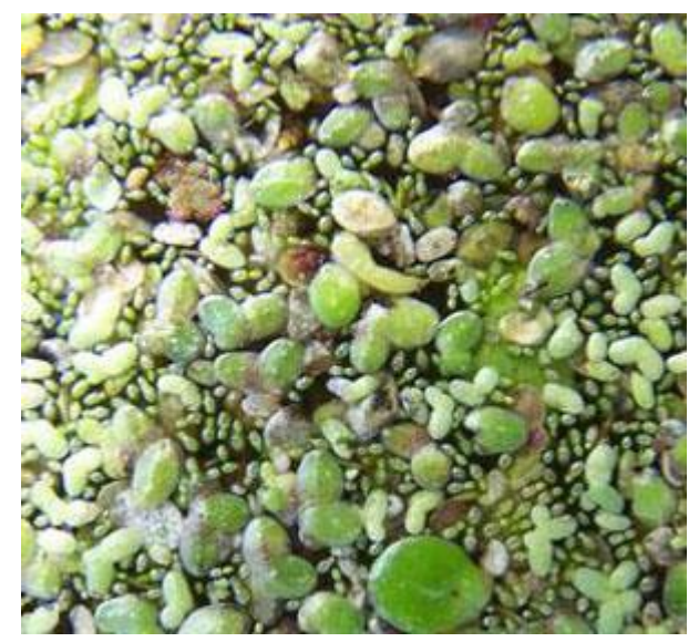
Duckweed (large leaves) mixed with watermeal

Free-floating plants, such as duckweed and watermeal are extremely small seed-bearing plants that float free on the water's surface. They never become rooted in the soil, and reproduce by sexual and asexual means. They can completely cover the surface of a pond. Both plants are found in nutrientrich waters so inflow of wastewater from livestock feedlots, septic fields, etc. should be avoided when possible.