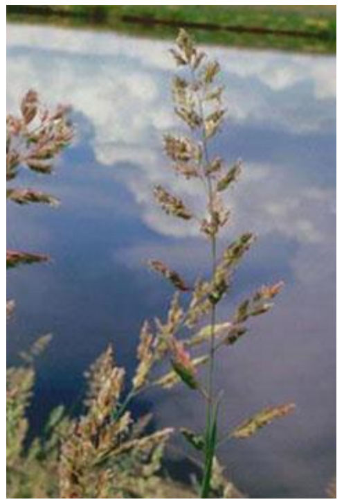
Red canarygrass