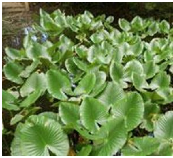
Spatterdock

Rooted floating plants include water lily, spatterdock, and water lotus. While the leaves float roots are anchored in the soil.