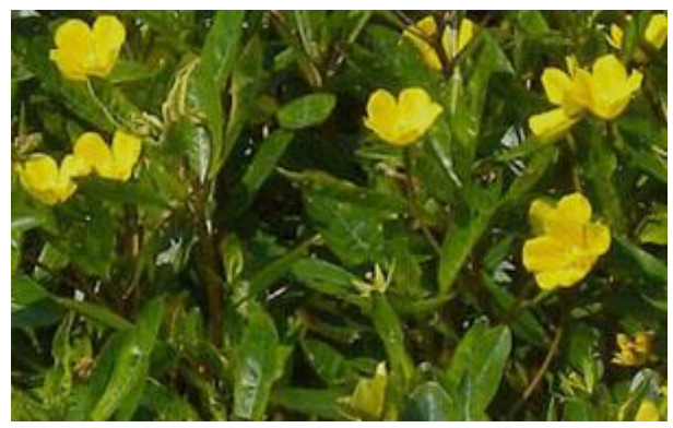
Creeping water primrose