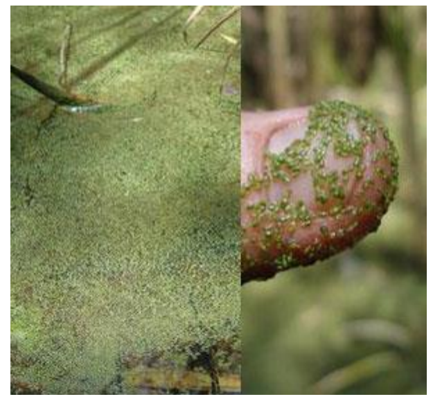
Watermeal; Graves Lovell, Alabama Department of Conservation and Natural Resources, Bugwood.org