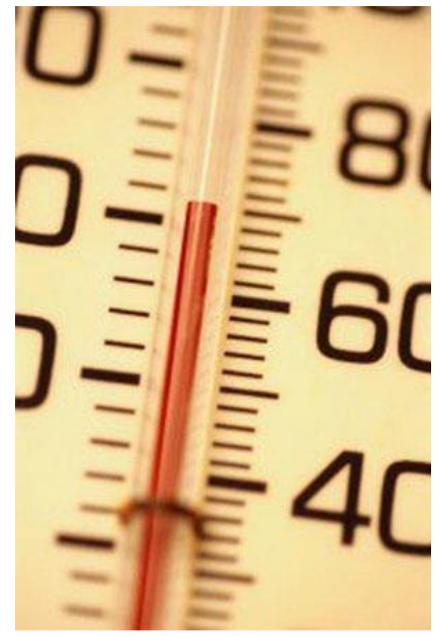
Ideal water temperature

Aquatic herbicides must be labeled for that use by the Environmental Protection Agency and registered with the Kentucky Department of Agriculture. They vary in their weed control spectrum, specific application sites, and application methods. After a weed has been correctly identified, read the labels carefully before buying and using any product. Most have restrictions that may prevent their use on particular bodies of water. Also, be sure to include secondary water uses (i.e., swimming, livestock watering and irrigation) when selecting products.