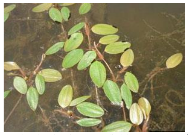
Waterthread pondweed

Leafy pondweed has very narrow leaves with an alternate arrangement. It is more common in ponds than in large lakes.