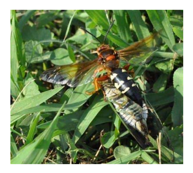
Fig 1. A female cicada killer approaches her burrow with a cicada. Tall grass does not seem to keep them from locating the entrance.

Mild mannered female cicada killer wasps are active across Kentucky during the summer, intent on their tasks of 1) digging underground burrows and 2) provisioning them with paralyzed cicadas that will be food for their grub-like larvae. The wasps will be very focused on these tasks for several weeks.