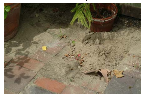
Fig. 3. Sand excavated by cicada killer wasp

Female cicada killers dig extensive tunnels where their young will be raised, displacing several pounds of soil in the process. Occasionally, it can result in some damage, such destabilizing a brick patio laid on sand. This is an instance when control may be needed.