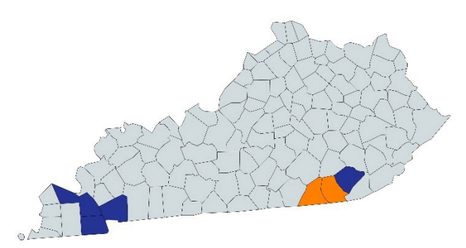
Figure 2: As of 2022, counties highlighted in blue have had confirmed IFA mounds that have been managed. Counties in orange have ongoing infestations.

It is difficult to know exactly how they entered Kentucky. Fire ants can move naturally with wind currents. It is also possible they were introduced with the movement of material like pine straw, mulch/compost, or possibly soil. Additionally, fire ants can be inadvertently moved in hay bales or even heavy machinery such as earth moving equipment and forestry equipment. They can also float as an ant "life raft" when there are floods. It is thought that this waterborne method may be how they arrived in western Kentucky. Once introduced, the colonies have gotten larger and eventually reproduced by sending out new queens to start their own nests.