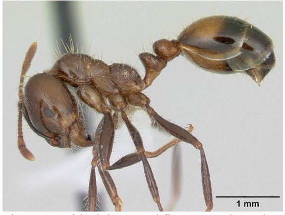
Figure 1: A black imported fire ant worker, Photo by April Noble, Antweb.org.

Fire ants prefer to nest in open, sunny areas often with large southern exposures. Their mounds can be commonly found in lawns, parks, and sports fields. Pastures, roadsides, meadows, and agriculture fields can also house ants.