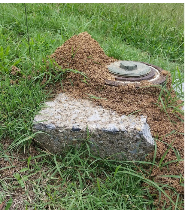
Figure 5: IFA mounds can be found near human made objects.

Fire ant mounds can help with field identification. IFA mounds in KY can be as large as 18-24 inches tall and up to 2 feet in width, however newly formed mounds are much smaller. The mound is made up of soil the ants have dug from below and there is no noticeable entrance hole to the mound. The mounds occur in open sunny locations where grass and weeds are sparce and may be built at the bases of trees, logs, fence posts, outdoor electric/irrigation housings, or up against structures. When the nest is disturbed, fire ants will "boil out" of the mound. This behavior is very distinctive, more associated with this species than with other more common ants in Kentucky.