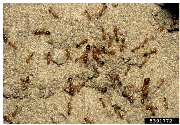
Figure 4: When a fire ant nest is disturbed, worker ants will rapidly appear. This behavior is described as "boiling out".

Conclusive identification of a fire ant requires the use of magnification to count the segments of the antenna, look for spines on the thorax, and to count the nodes of the suspect ant. IFA have ten segmented antennae, with the last two resembling a "club", no spines on the thorax, and two nodes on their "waist". This identification is best done by an entomologist, and you can submit samples to us through your local county Extension office for identification.