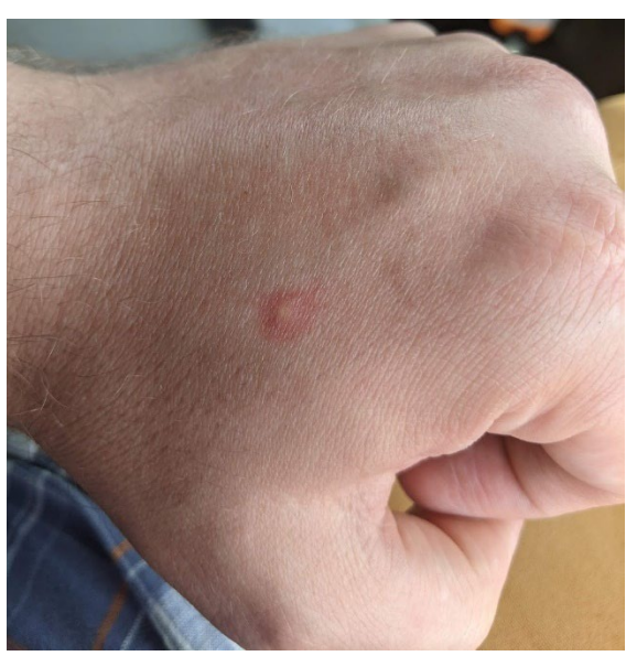
Figure 6: Fire ants bite and sting simultaneously. Each ant can sting multiple times. Stings inflame the skin and will gradually harden and form a white pustule like top.

The sting is painful, often described as causing a burning sensation at the sting site. The burning will gradually fade though the sting site may continue to hurt for hours after the incident. Gradually, the sting site will redden and there could be the development of an almost pimple like structure. Some people may be more sensitive to the venom than others. This can lead to anaphylaxis. Individuals with a sensitivity to other insect stings should take care to avoid fire ants and be sure to carry their epinephrine with them.