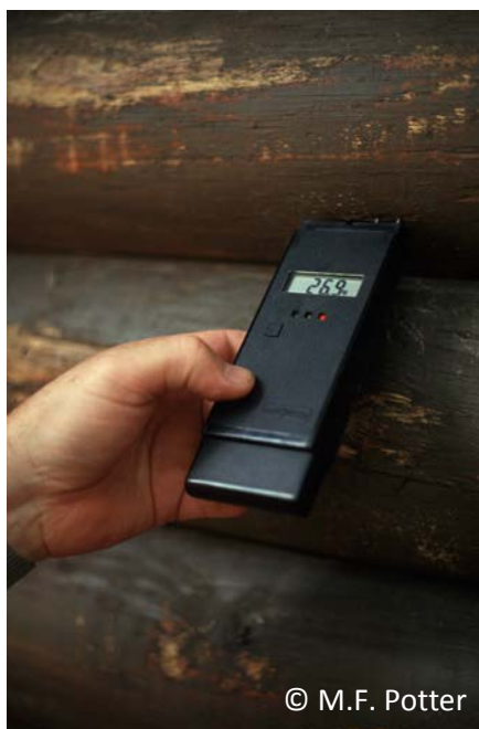
Fig. 8: Moisture meters are useful tools for predicting potential reinfestation.

Moisture Control- Anobiid powderpost beetles in particular have high moisture requirements for survival. Wood moisture below 14 percent during spring and summer are generally unsuitable for development. Therefore, it is advisable to install a moisture barrier in damp crawl spaces that are infested. Covering the soil with polyethylene sheeting reduces movement of moisture into the substructure and reduces the threat of the infestation spreading upward into buildings. Other ways to lower wood moisture content in crawl spaces is to improve drainage and increase air circulation by installing foundation vents. Moisture meters utilized by pest control firms are handy tools for measuring the moisture content of wood and predicting the potential for infestation (Figure 8).