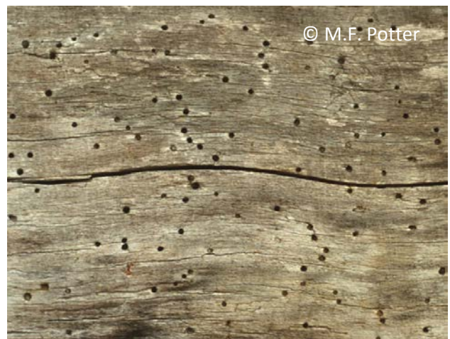
Fig. 6a-b: Active versus inactive infestations. The former usually have fresh powder accompanying the emergence holes.