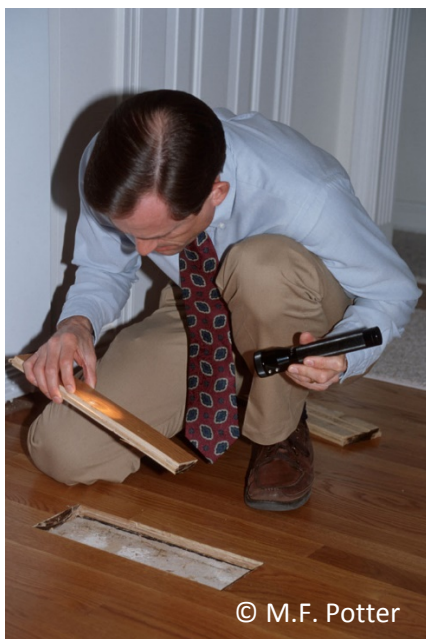
Fig. 7: Replacing small sections of damaged wood can be an effective means of control.

Wood Replacement - Oftentimes, indications of beetle activity are limited to small sections of flooring or a few pieces of molding, trim, etc. The most efficient approach is often to remove and replace them, along with any boards or pieces directly adjacent as a precaution (Figure 7).