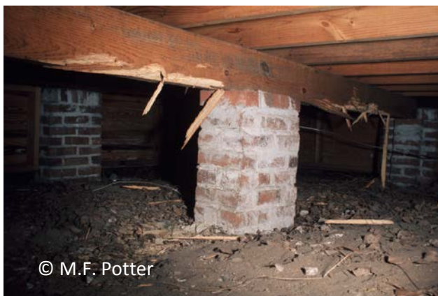
Fig. 4a-b: Anobiid powderpost beetles infest damp areas such as crawl spaces.

Emergence of adult anobiids generally occurs during the spring and summer months. In nature,