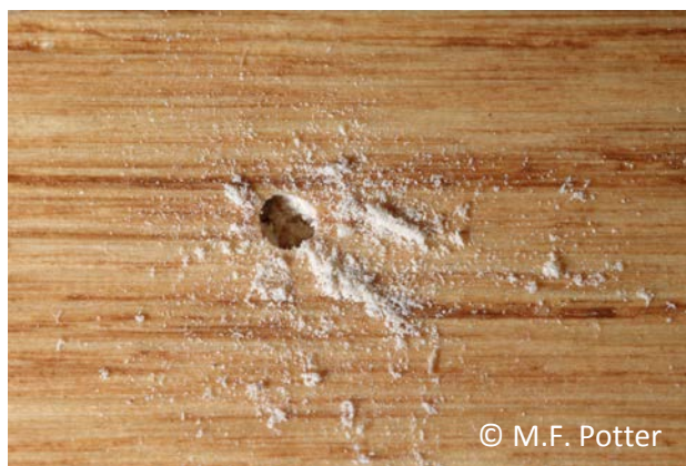
Fig. 1a-b: Powderpost beetles produce small round holes accompanied by wood powder.

Lyctid powderpost beetles are small (1/16-1/4 inch), narrow and elongated, reddish-brown to black beetles (Figure 2). Their emergence holes are round and about the size of a pinhead. The powdery dust feels like flour or fine talc, and often accumulates in small piles beneath or beside emergence holes. Lyctid powderpost beetles attack only wood products manufactured from hardwood (broadleaf) trees such as oak, ash, walnut, hickory, poplar or cherry.