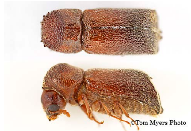
Fig. 3a-b: Bostrichid powderpost beetles have a ‘hood like’ appearance up by the head.

Anobiid powderpost beetles are convex, reddish to dark brown beetles capable of attacking both hardwoods and softwoods. They are sometimes confused with drugstore and cigarette beetles that also occur in homes but infest stored foods. The emergence holes are 1/16-1/8 inch. Rubbed between the fingers, the powder sifting from the holes and accumulating in small piles may feel gritty (although for a few species attacking hardwoods this is not the case). Unlike the powderpost beetles discussed previously, anobiids can seriously damage beams, joists, and other structural components of buildings. Anobiids prefer to infest moist wood. A 13-30% moisture content is required for development of the larvae. Consequently, infestations are most severe in damp crawl spaces, basements, garages, and unheated outbuildings (Figure 4). Buildings with central heating and cooling seldom have sufficient dampness to support beetle development in living areas or attics.