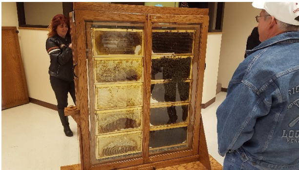
Figure 1. Observation hive can be very elaborate.

Honey bees are truly amazing creatures to watch, and an observation hive allows you to see day-to-day activities within the hive without disrupting or irritating the bees.