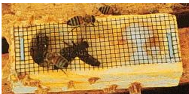
Figure 3 Inspect the queen in her cage when she arrives.

Remove the pasteboard over the candy end of the queen cage and use a small nail to punch a small hole through the candy. Do not make the hole so large that the queen can get out immediately.