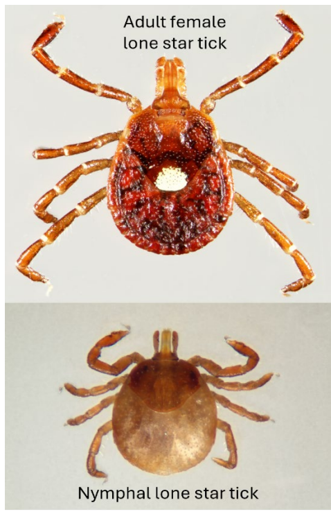
Figure 1: Adult female lone star ticks have a white dot on their back. Immatures lack the dot but are "rounder" than other tick species.

Not every bite from a lone star tick will result in alpha-gal syndrome. This could be due to the tick or to the immune response of the person who was bitten. It is more likely that red meat allergy is associated with adult and nymphal ticks than with larval ticks (aka seed ticks).